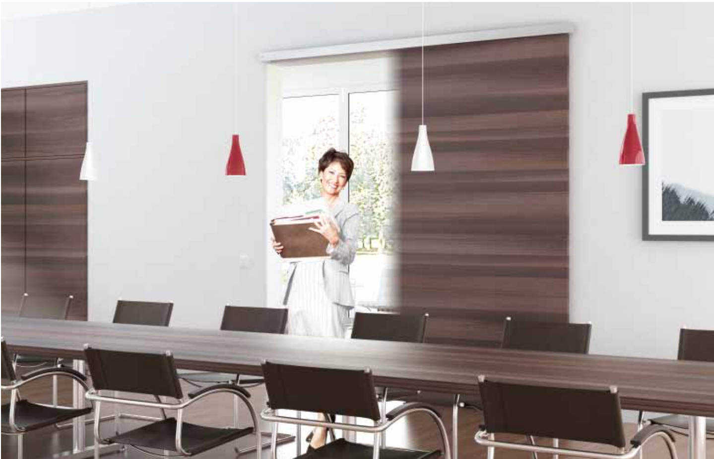
CS 80 MAGNEO automatic sliding door operator – here applied to the timber door of a conference room.

“Whenever we have our hands full, automatic doors make life easier.”