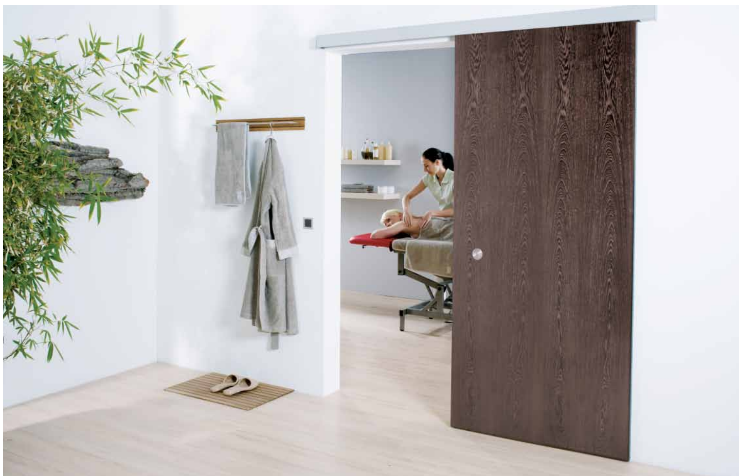
CS 80 MAGNEO automatic sliding door. Especially suitable whenever doors need to be operated without direct contact, for example in healthcare facilities: Controlled by a proximity-type switch (MagicSwitch).

“Automatic door solutions are almost indispensable when hygiene comes into play.”